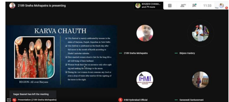
Glimpses of the webinar