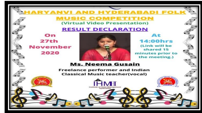
Banner for publicity of the webinar