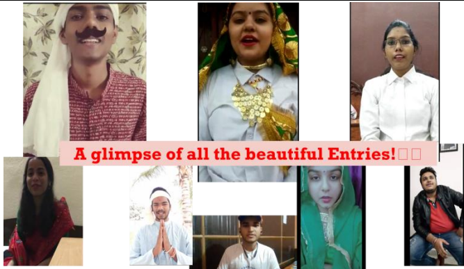
Glimpses of the entries