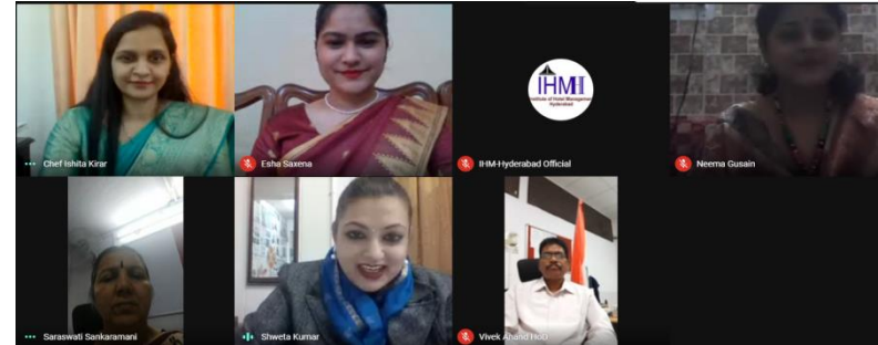
Glimpses of the webinar